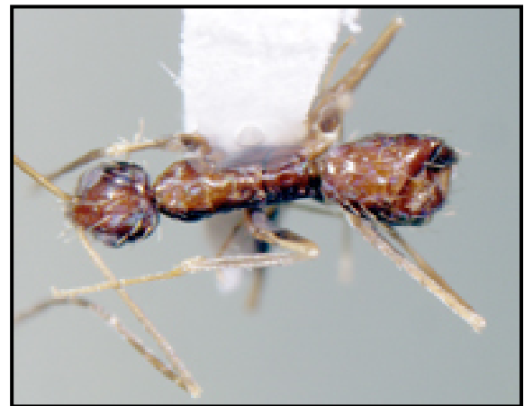
Crazy ant worker.

Mention of commercial products is for educational purposes only and does not represent endorsement by Texas Cooperative Extension or The Texas A&M University System. Insecticide label registrations are subject to change, and changes may have occurred since this publication was printed. The pesticide user is always responsible for applying products in accordance with label directions. Always read and carefully follow the instructions on the container label.