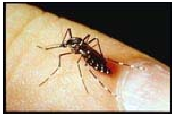
Asian tiger mosquito, Aedes albopictus (Skuse) (Diptera: Culicidae).

Mention of commercial products is for educational purposes only and does not represent endorsement by Texas Cooperative Extension or The Texas A&M University System. Insecticide label registrations are subject to change, and changes may have occurred since this publication was printed. The pesticide user is always responsible for applying products in accordance with label directions. Always read and carefully follow the instructions on the container label.