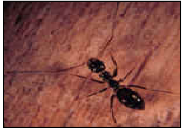
Crazy ant worker.

Outdoor colonies can be treated with dusts, residual sprays, baits and granular insecticides. Indoor colonies can be treated with residual sprays as spot treatments, dusts, and baits.